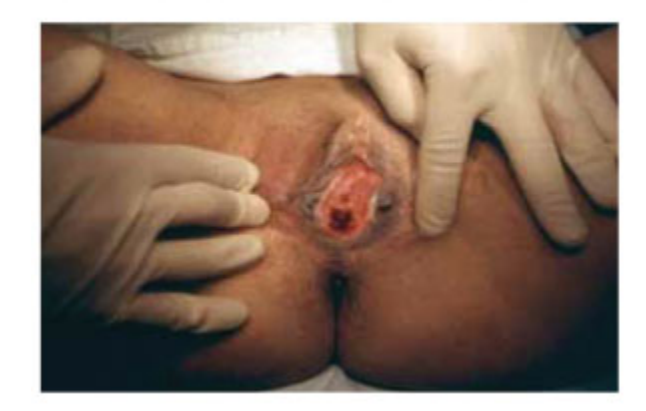
Figure 4 - A postoperative case of sigmoid vaginoplasty.

During follow up, the neovagina was found to have an excellent cosmetic appearance ( \frac{\text{Figure-4}}{\text{I}} ). The mean vaginal length was 13.0 cm (range 10.5 – 15 cm). Vaginograms showed that all patients achieved a neovagina of adequate length and caliber ( \frac{\text{Figure-5}}{\text{I}} ).